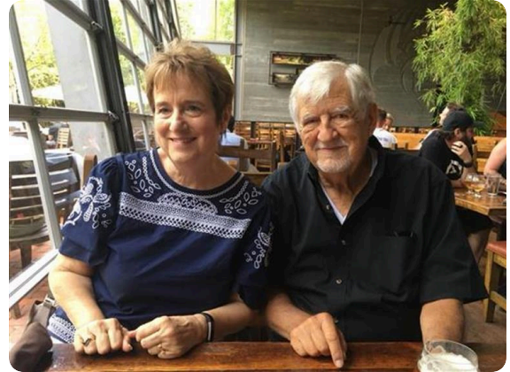
So Happy Together