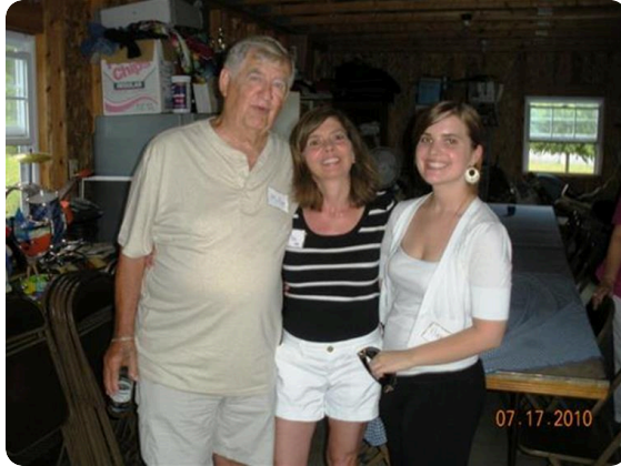
Loving our Uncle and Great Uncle